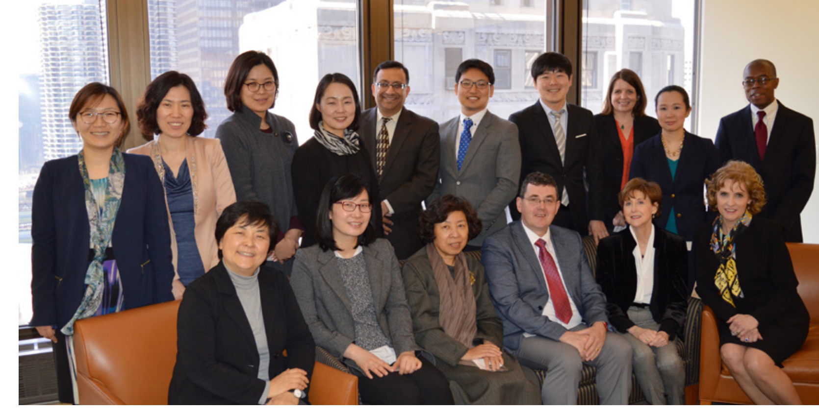
continued from page 5

For additional information or questions, contact nursecompact@ncsbn.org .