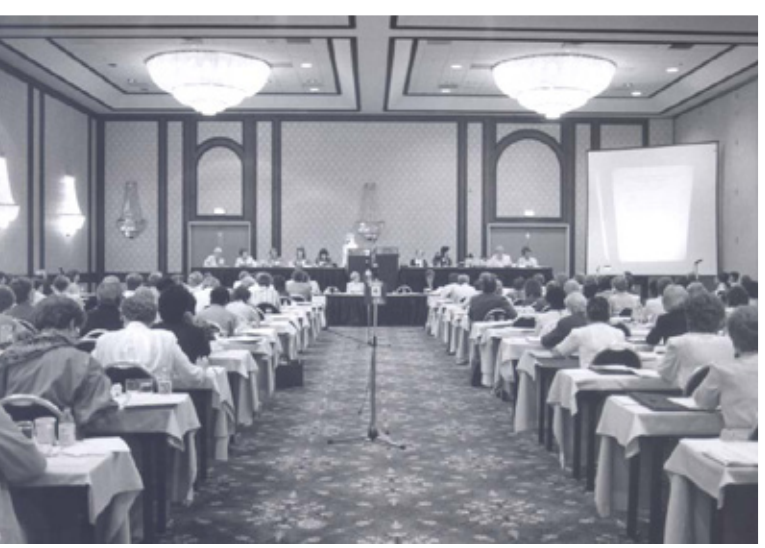
Delegate Assembly, 1987