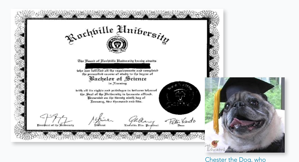
Figure 3: Bachelor of Science in Nursing from Rochville University, a Diploma Mill<sup>3</sup>

Diploma mills often cause confusion as a result of their vague accreditation status. They also confuse valid avenues of nontraditional education and alternative means of earning credit. For instance, one can earn credit by examination (e.g., CLEP), independent study, online programs and work experience/internships. While credit may be given for work experience, an entire degree cannot be. The premise of diploma mills is that they award degrees based on one's life experience, so usually no coursework is required. As such, diploma mills are also a form of fraud, as their qualifications do not represent formal academic study. Unfortunately, degree mills persist because the Internet and an easy electronic banking system have provided a way to remain anonymous and advertise to millions of people at very little cost.