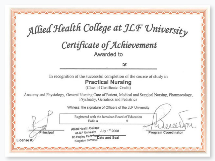
Figure 4: Practical Nursing Certificate from JLF University Allied Health College, which was prosecuted in the state of Florida in 2011

Figure 4 above shows a practical nursing certificate from Allied Health College at JLF University. JLF University, which has affiliated locations in Florida, Haiti and Jamaica, was sued by Florida Attorney General Pam Bondi for defrauding students in 2011. The following year, the university and its affiliates were required to pay $469,000 in restitution and an additional $67,000 in civil penalties<sup>7</sup>. The institution's website and the transcript for the above qualification together claim accreditation by Accrediting Commission International (ACI), the Association of Distance Learning Programs (ADLP), and the United States Distance Learning Association (USDLA). However, all three entities are accreditation mills.