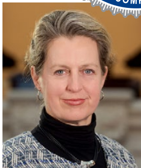
Sen. Kristina Roegner OHIO

Licensure requirements are uniform across NLC states, so nurses who are issued a multistate license have met the same requirements, which include a federal and state criminal background check. In the event of a disaster (such as the COVID-19 pandemic), nurses from compact states can easily respond to supply vital services. Additionally, many nurses—including primary care nurses, case managers, transport nurses, school and hospice nurses, among many others—need to routinely cross state boundaries to provide the public with access to nursing services, and a multistate license facilitates this process.