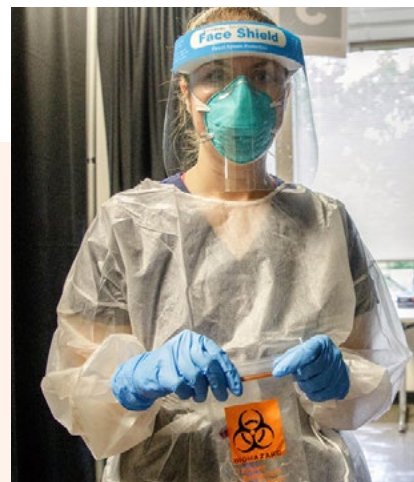
GW Nursing student post-nasal swab collection, preparing the sample for transfer to the lab.