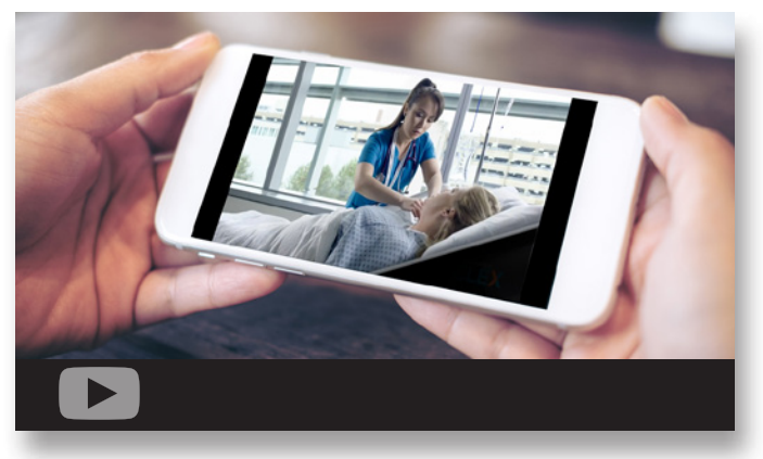
Click to view the 30-second Next Generation NCLEX commercial.

The campaign will run over a period of several years and will be evaluated on an ongoing basis to adapt its messages and how they are delivered to best promote NGN to the targeted audiences. •