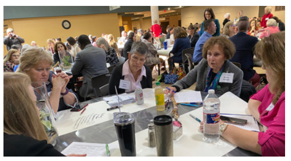
Photos taken Feb. 24–25, 2020, prior to social distancing mandates.