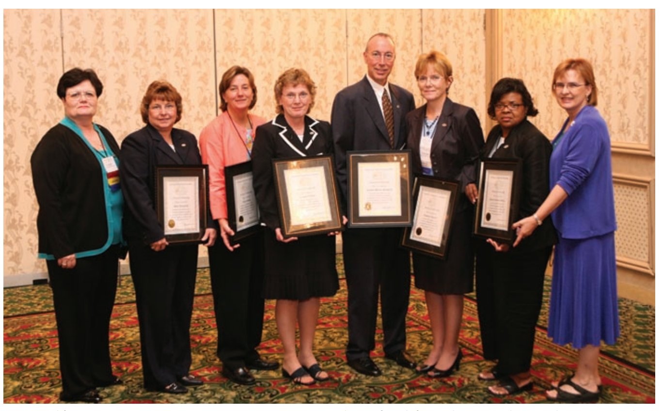
Continued from page 30