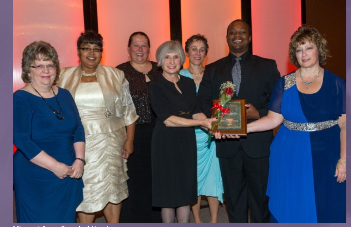
Missouri State Board of Nursing