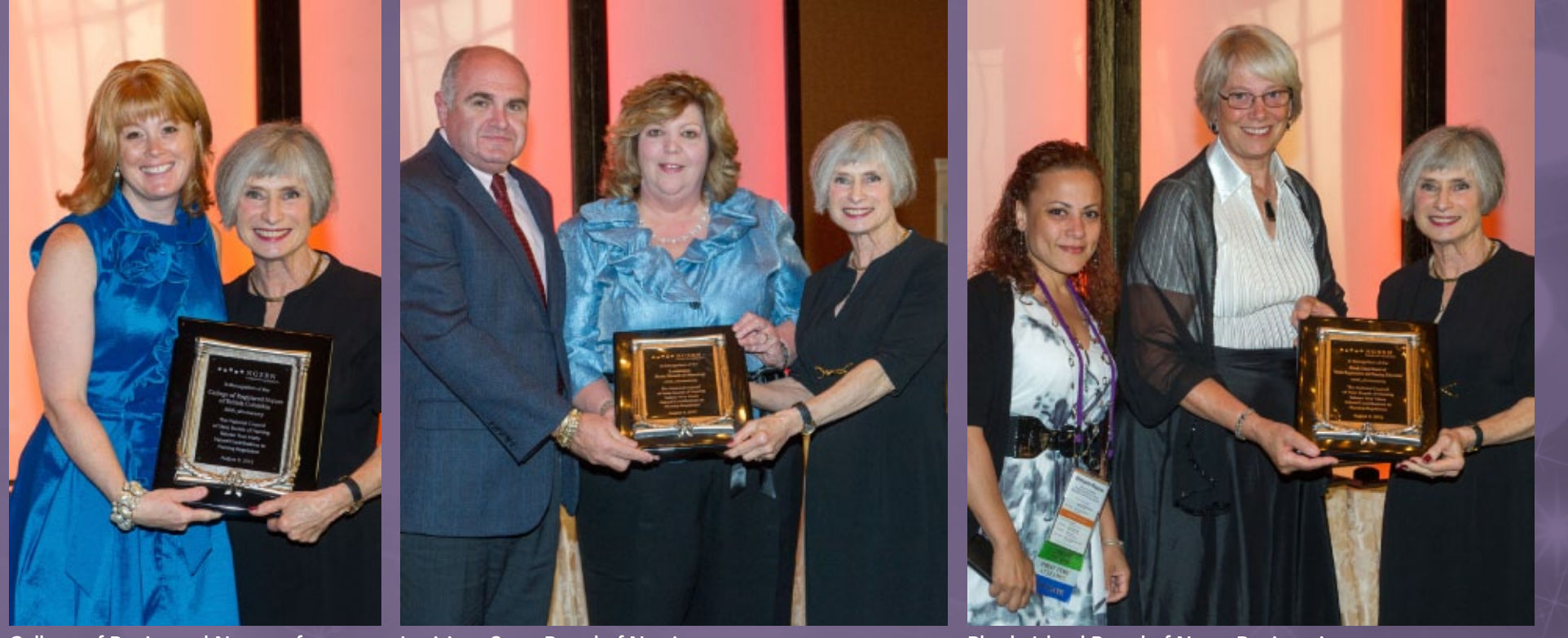
College of Registered Nurses of British Columbia