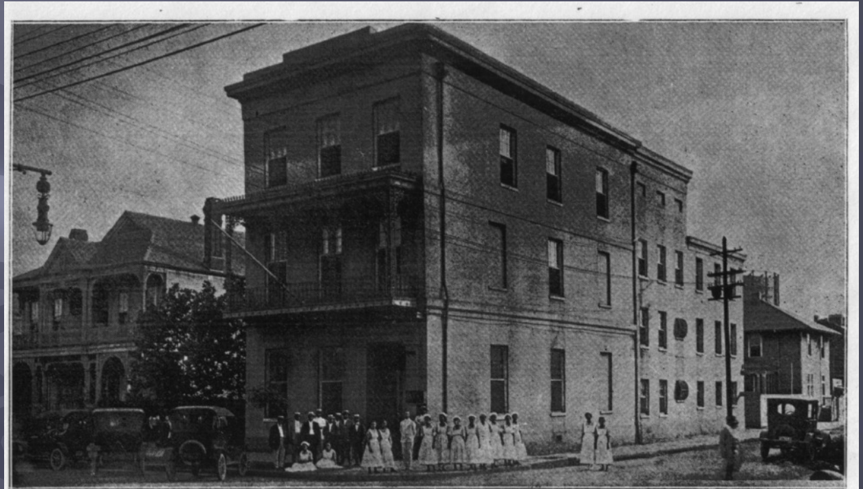
THE FLINT-GOODRIDGE HOSPITAL AND NURSE-TRAINING SCHOOL.