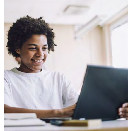
Microsoft PowerPoint Stock Image