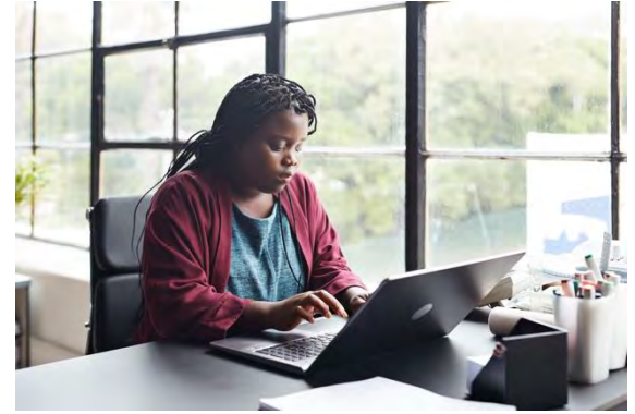
Microsoft PowerPoint Stock Image