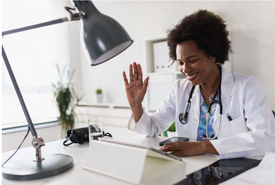
Microsoft PowerPoint Stock Image