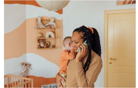
Microsoft PowerPoint Stock Image