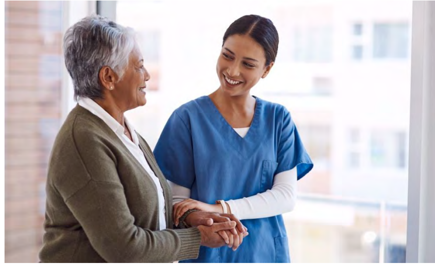
Microsoft PowerPoint Stock Image