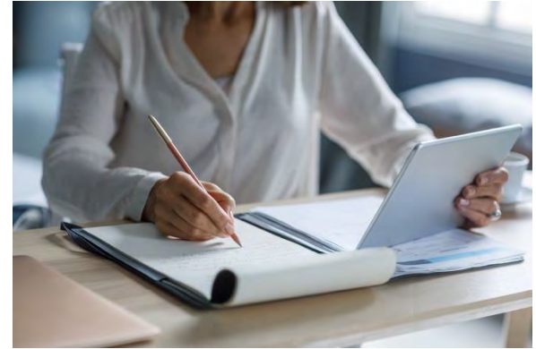
MS PowerPoint Stock Image