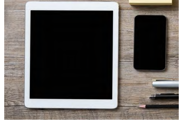
Microsoft PowerPoint Stock Image