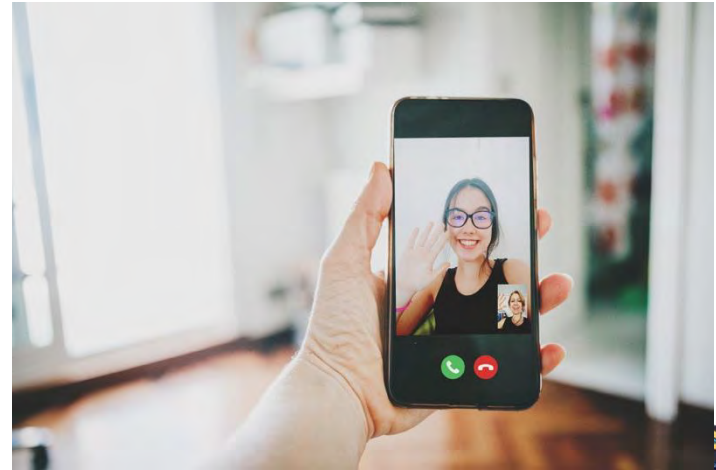
Microsoft PowerPoint Stock Image