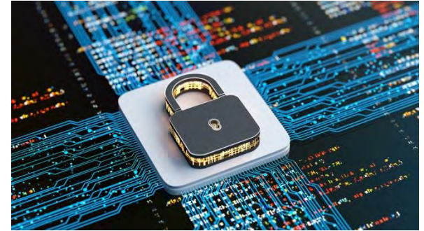
Microsoft PowerPoint Stock Image