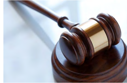
Microsoft PowerPoint Stock Image