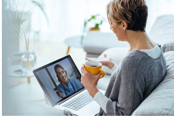
Microsoft PowerPoint Stock Image