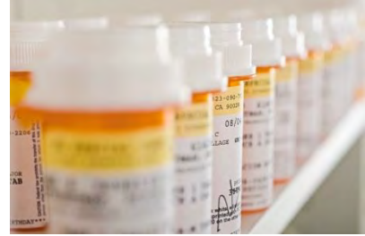
Microsoft PowerPoint Stock Image