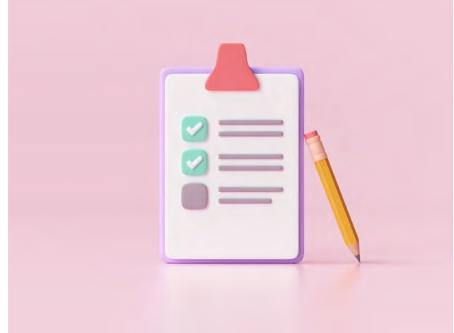
Microsoft PowerPoint Stock Photo