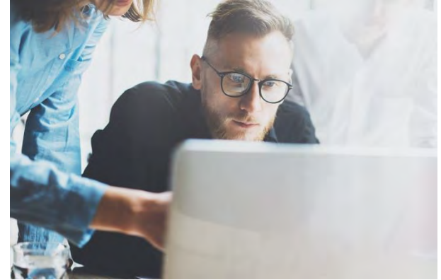
Microsoft PowerPoint Stock Image