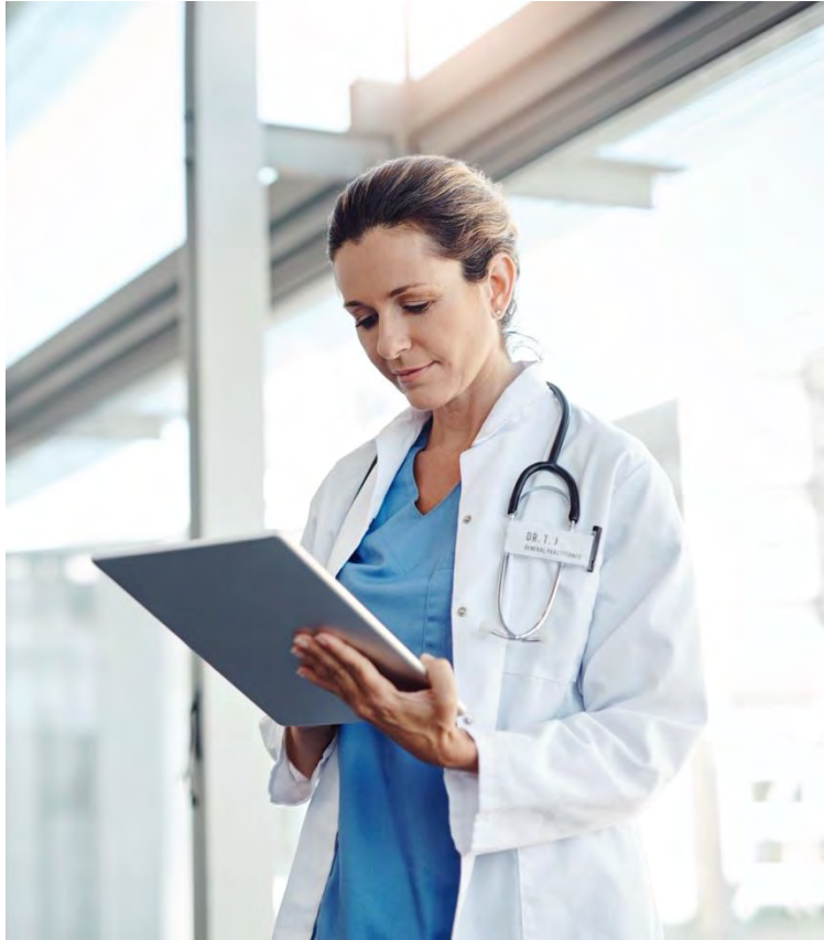
Microsoft PowerPoint Stock Image