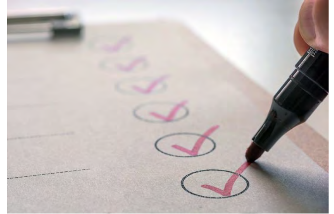
MS PowerPoint Stock Image