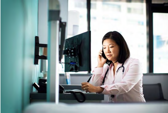
Microsoft PowerPoint Stock Image